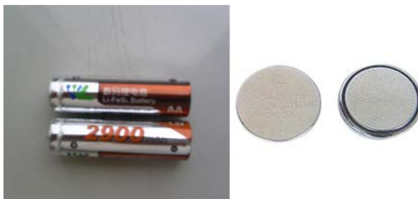
Figure 1 - Example of Lithium Metal Batteries

Lithium metal batteries packed by themselves (not contained in or packed with equipment) (Packing Instruction 968) are forbidden for transport as cargo on passenger aircraft).