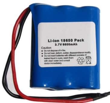
Figure 2 - Example of a Lithium Ion Battery

Lithium-ion batteries (sometimes abbreviated Li-ion batteries). Are a type of secondary (rechargeable) battery commonly used in consumer electronics. Also included within the category of lithium-ion batteries are lithium polymer batteries. Lithium-ion batteries are generally found in mobile telephones, laptop computers, etc.